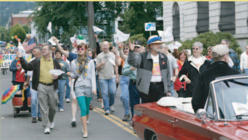
Our House at Gay Pride 2007