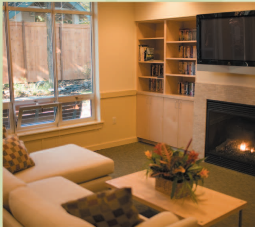
Our House Resident Living Room